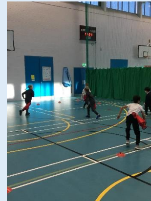
Year 4 TAG Rugby

Picture direct from the first tag rugby session in two years! The Children in 4B had so much fun! Thank you to the University of Chester for the excellent sessions.