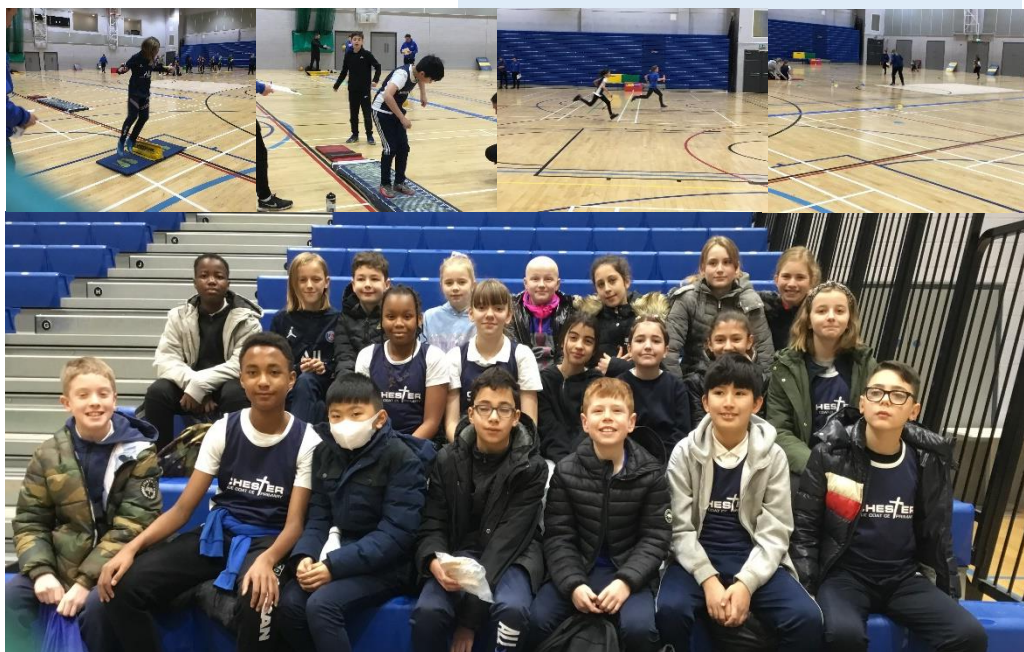
The Year 6 Team of competitors at the SportsHall Competition