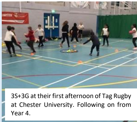
3S+3G at their first afternoon of Tag Rugby at Chester University. Following on from Year 4.